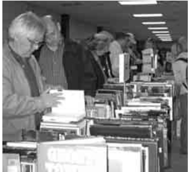
The Mammoth Book Sale is always well attended.