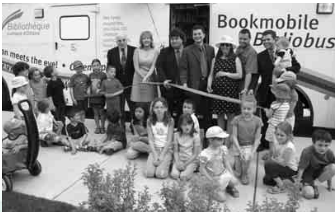
The new bookmobile was launched at St. Jerome school with children, OPL board members and community VIPs in attendance.