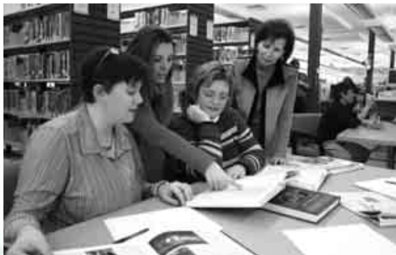
OPL staff work hard to provide excellent customer service.

* Increase in 2005 was as a result $1.5 m for Job Evaluation and $3.4 m was for Pay Equity.