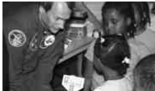
Every Kid a Card Chair Steve MacLean gets children dreaming about the stars

An astounding number of children participated in the Library's second annual Every Kid a Card campaign and received their first library card or renewed their existing one. Canadian Space Agency Astronaut Steve MacLean lent his support to the campaign which was also sponsored by Staples Business Depot, the Ottawa 67's, Pizza Pizza, CTV Ottawa, the Ottawa Citizen, Majic 100 and L'Express.