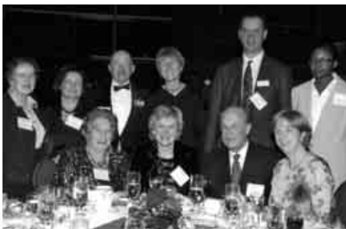
The Friends were out in force supporting the Literary Gala.

FOPLA representations during the 2005 Budget debates did not prevent some minor reductions in the OPL draft budget. Unfortunately, many citizens and some municipal politicians felt the annual library budget could be reduced without damage to the public good. OPL's funding ranks 25 out of 37 Canadian cities with populations over 100,000. It is our view that only the efforts of a most competent library staff maintains the OPL in relatively good working order rather than in decline.