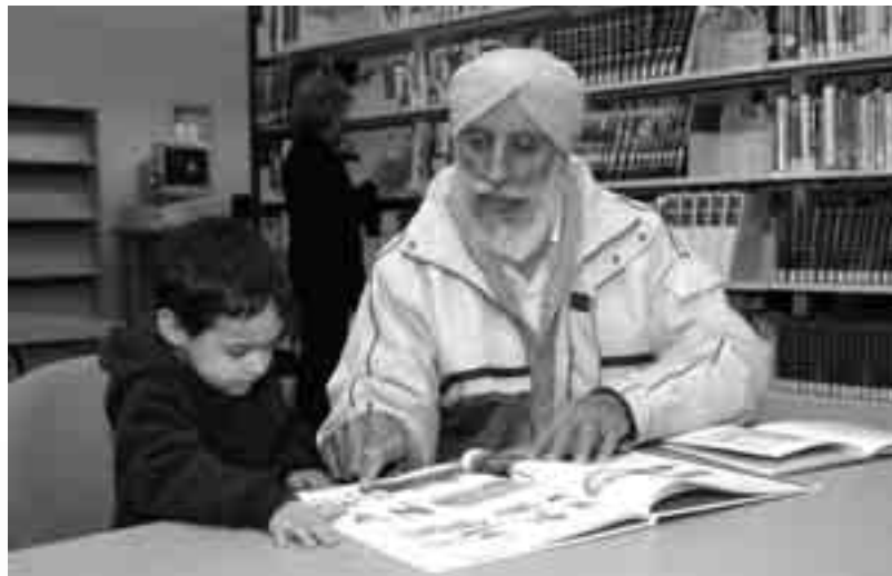
Thousands of families visit the OPL every year.