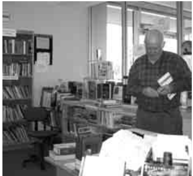
Bookshops form the backbone of the Friends fundraising efforts.