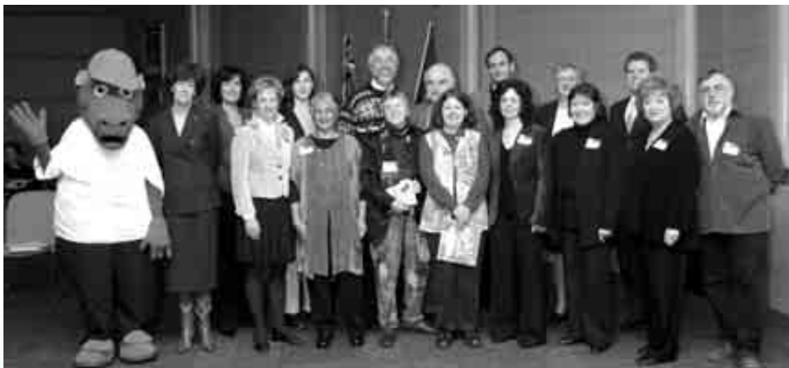
Bopl, our fire-reading dragon, poses for a picture with the Kid's Lit Gala authors, emcee, Ottawa Children's Literature Roundtable members and OPL board members.