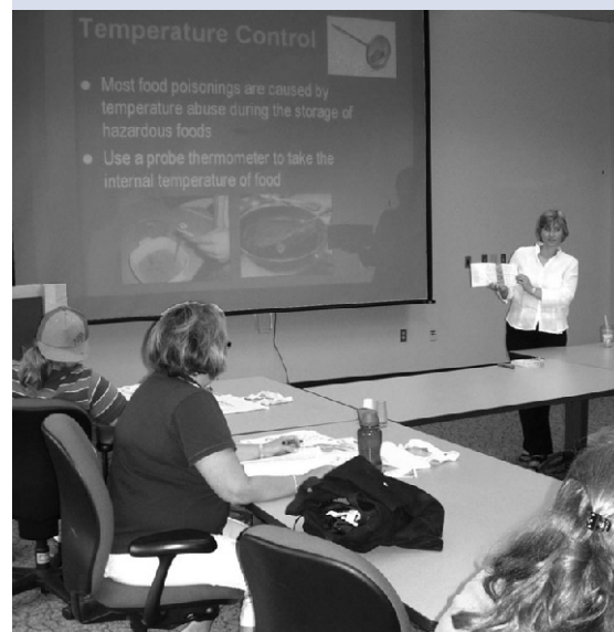
Food Handler Training

The Environment and Health Protection Division safeguards the health of the community through risk assessment, community mobilization and promotion of optimal health, and protects residents against environmental health hazards.