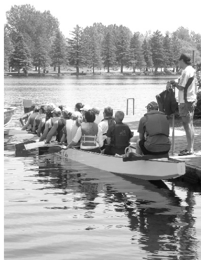
Live it Up... program

Thank you to our many generous donors who provide space, refreshments and prizes for events, and hours of in-kind support.