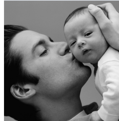
Power of Dads