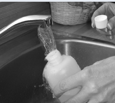
Well water testing