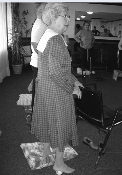
Home Support Exercise