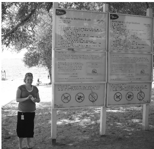
Monitoring public beaches